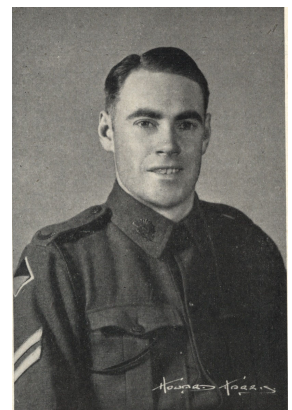
Corporal J.H. Edmondson VC Killed in Action, Tobruk 1941