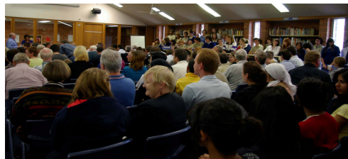
Packed House. 200 at the Save Hurlstone Meeting

The Macarthur Advertiser is supportive and Campbelltown City Council oppose the sale, arguing that the farm provides much needed local green space