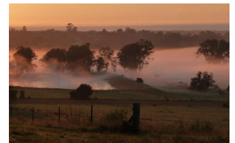
Valuable green space and fresh air. HAHS helps as the natural lungs of the local area

water resources —the state government is proposing to sell the farm from a farm school to cover its financial mismanagement.