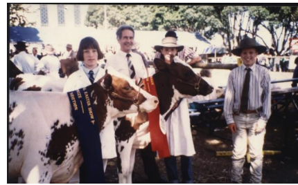
Hurlstone is the only school to show dairy at the Royal Easter Show