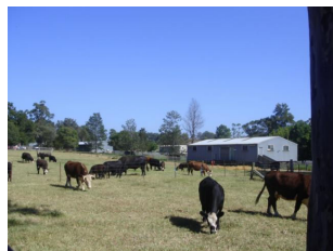
Land not in use says DET? The Ayreshire Dairy herd is living proof of the working farm

While the State Government has proposed to sell up to 140 ha of the farm, suggesting it is surplus land, a recent study has shown the farm is fully utilized. The proposed 20 ha will not accommodate the current fixed infrastructure never mind the work-