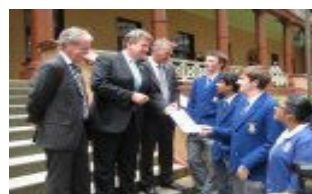
“Help save Hurlstone’s Farm” Letter signed by 600 students

superfluous to modern agriculture. A modern agriculture education doesn't mean no cows, no sheep, no crops, as convenient as that might seem to the Education Department.